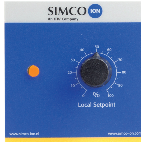
External control kit optional